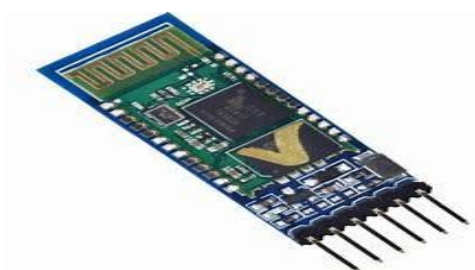
Fig.3. Bluetooth Module