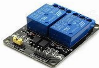
Fig.5. Relay module

A 2 channel & 5V relay module can be used as a switch to ON or OFF a device which requires a sudden load of large voltage. It has two outputs which can be used to switch between ON and OFF in a fast way. It has two outputs as normally open and normally closed. The functions of the two pins depend on the connection of the input pins with the ground.