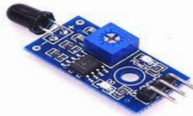
Fig.4. Flame Sensor Module

The Flame Sensor Module can detect flames in the 750 – 1100 nanometer wavelength range [9]. It is used to detect small flames and it can detect a flame at roughly 0.8m. The detection angle is roughly 45 degrees and the sensor is sensitive particularly to the flame spectrum.