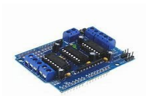
Fig.2. L293D motor driver

L293D is a typical Motor driver circuit board which helps in the movement of DC motor on either direction. L293D is a 16-pin IC which can control a set of four Gear motors simultaneously in both directions. It is used as a shield with Arduino. It can be interfaced with Arduino by mounting it over the Arduino. The movement of gear motors are controlled by the Motor driver.