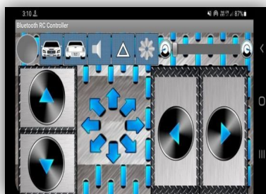
Fig.9. Bluetooth RC controller