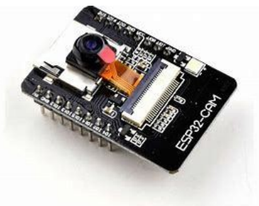
Fig.8. ESP32 Cam

The ESP32-CAM is a full-featured microcontroller equipped with an integrated video camera to capture the video and send it to the smart device. In addition to that it also has an integrated slot to store the recorded video. It is cheap and can be used conveniently in those IoT projects which require a camera. It has components on both of its sides. The camera is integrated on one side while the pins are on other side. The camera is replaceable as it is connected through the pins on the top of the board. The camera is of 2 megapixels and its video transfer rate is 15 to 60 fps.