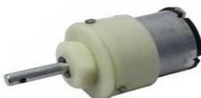
Fig.7. Gear Motors

A gear motor is a rotating motor equipped with gears which is used to move the robot with heavy weight mounted on it. The gears provide the strength to the motor to bear more load. Gearmotors act as torque multipliers and speed reducers which reduces the power consumption to drive a given load.