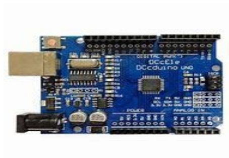
Fig.1. arduino uno

The robot is made up and interfaced with all other components using two microcontrollers known as Arduino uno. The board has some set of digital and analog input/output pins that may be connected to various sensors and other circuits [8]. The board has 14 digital I/O pins (six of them is PWM output) along with 6 analog Input pins, and can be programmed using the Arduino IDE (Integrated Development Environment), by connecting it to a device containing the IDE. The power is supplied by the USB cable or by an external 9-volt battery. It has a voltage limit between 7 and 20 volts.